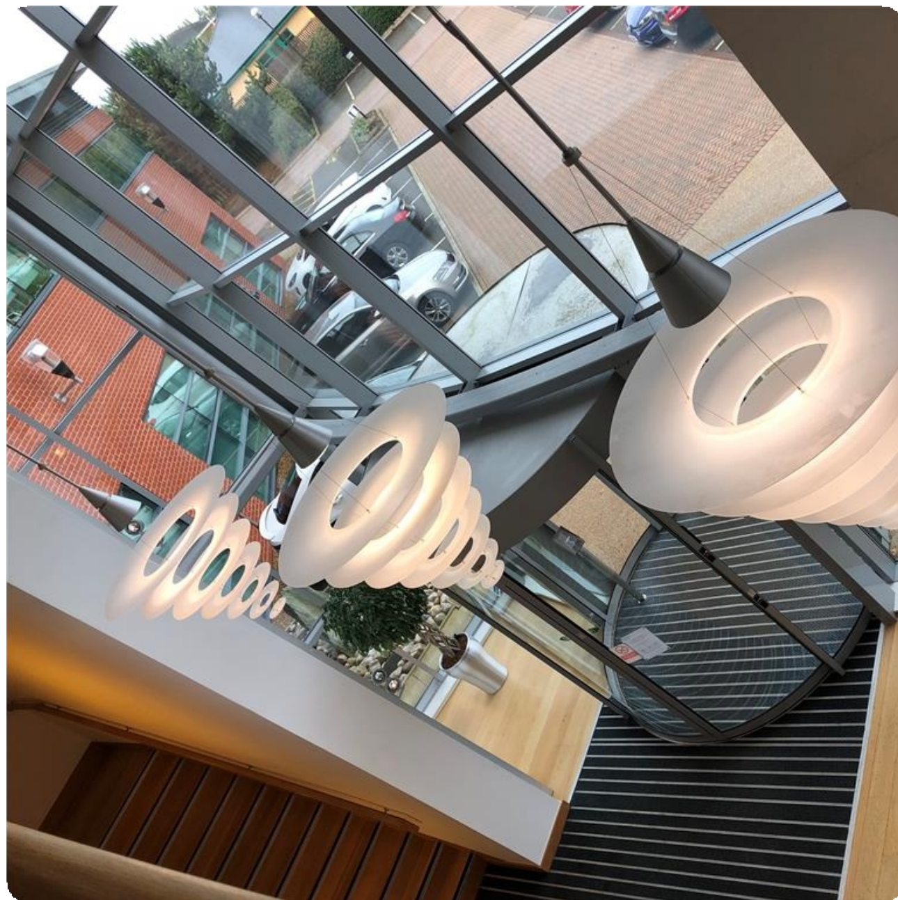
First Floor Office, George House, Herald Avenue, Coventry Business Park, Coventry, West Midlands, CV5 6UB