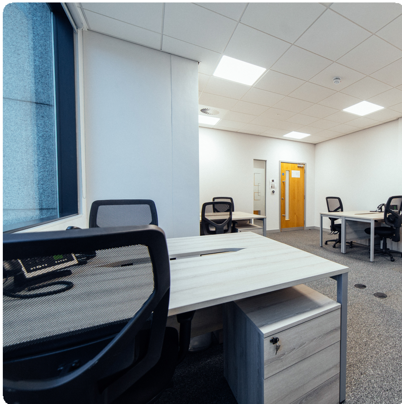
Fig Flex Friars House, Manor House Drive, Coventry, CV1 2TE