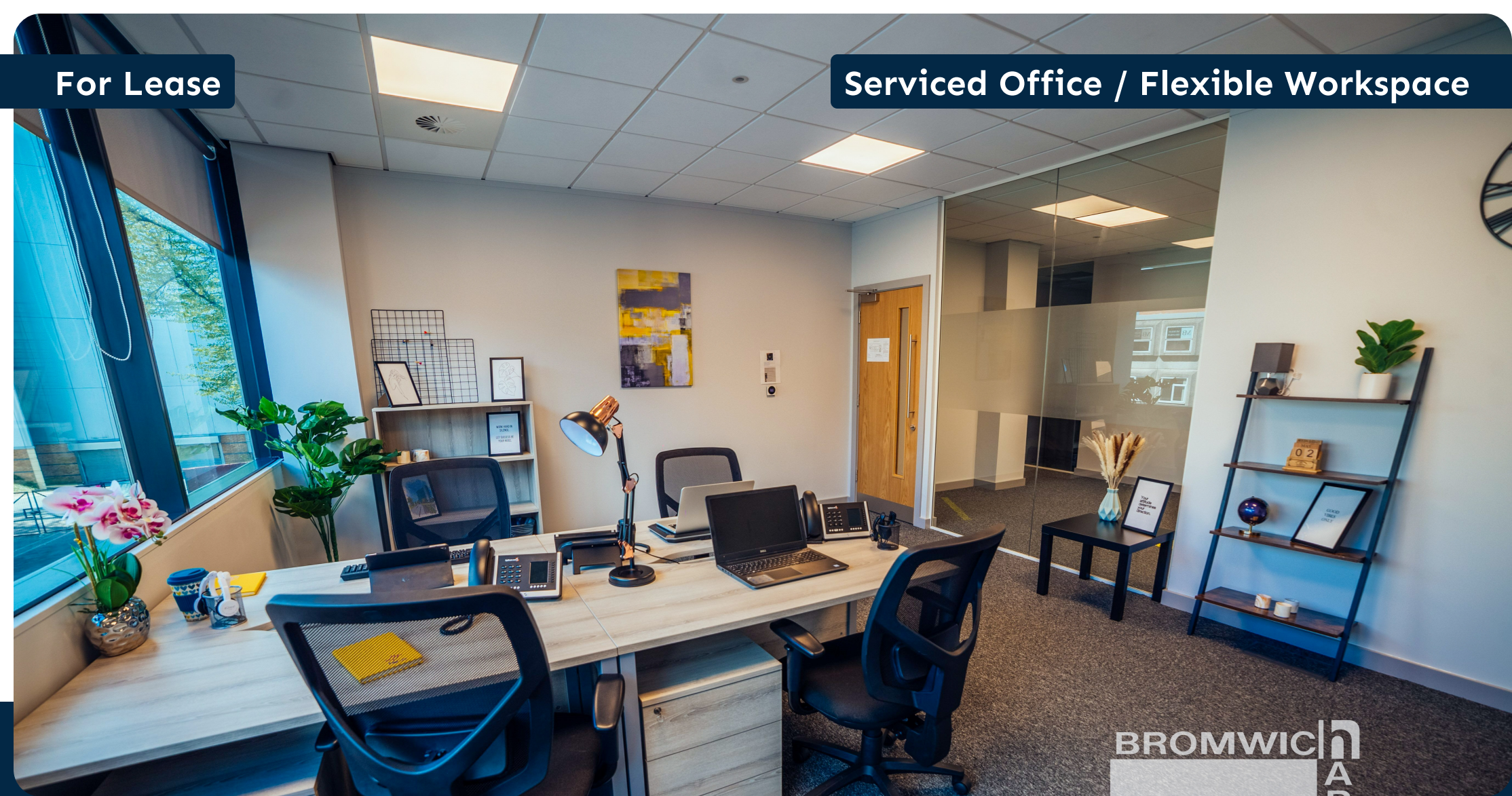
Fig Flex Friars House