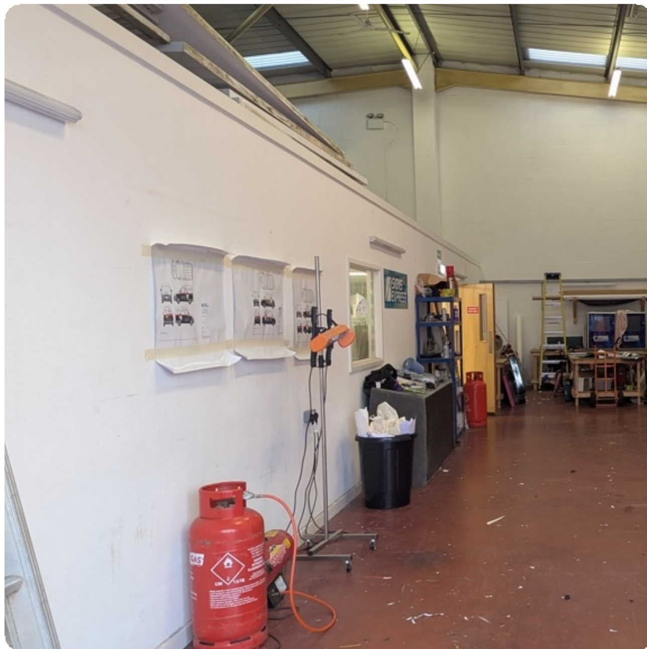
Central City Unit 5, Red Lane, Coventry, CV6 5RY