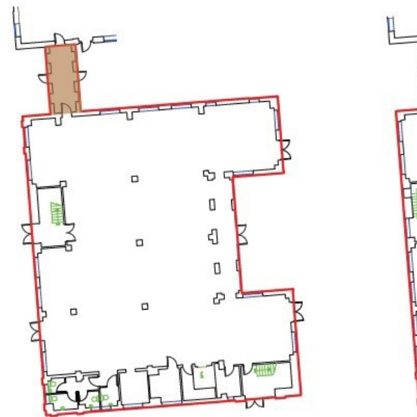
Ground Floor Plan 1:200@A2