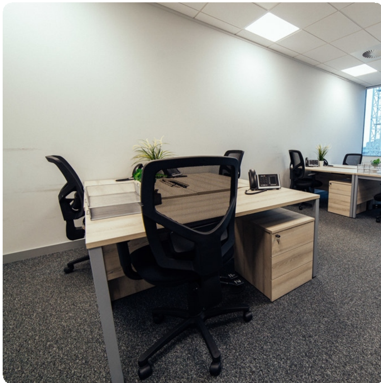
Fig Flex Friars House, Manor House Drive, Coventry, CV1 2TE